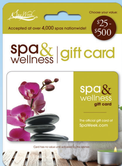
(Variable Load Card with hanger)